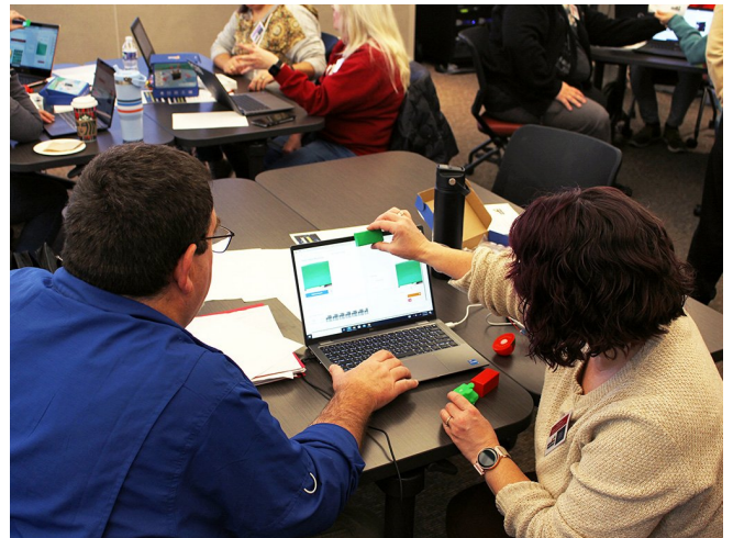
During a lesson about using AI to help with colorblindness, teachers trained AI models to detect different colors.

Last month, the AI Goes Rural team warmly welcomed 23 K-12 educators from nine different schools across Indiana to participate in "Middle School AI Explorers: Professional Development for Educators." This engaging professional development session provided a unique opportunity for teachers to not only learn from the AI Goes Rural team but also foster collaborative learning among themselves.